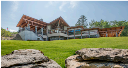
John Boyd Thacher State Park Visitor Center Voorheesville, NY