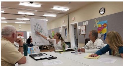
Comprehensive Plan Charrette East Fishkill, NY