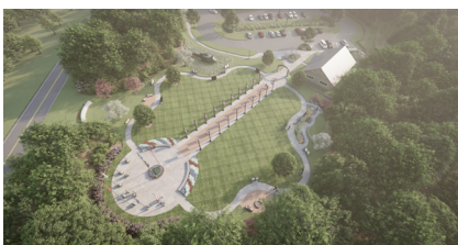
Veterans Memorial Park East Fishkill, NY