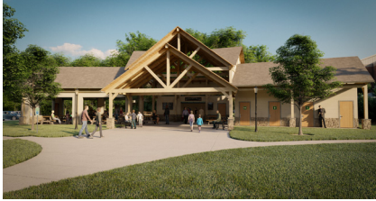
Center Park Pavilion Concept Dolgeville, NY