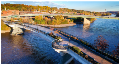
Mohawk Valley Gateway Overlook Pedestrian Bridge Amsterdam, NY